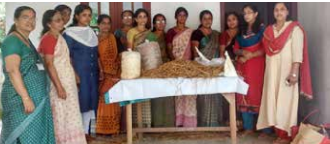
Participants of mushroom cultivation with the prepared mushroom beds