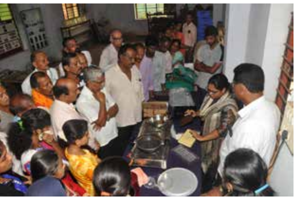
Training programme on 'Cocoa production and processing technology' at Bantwal, D.K., Karnataka