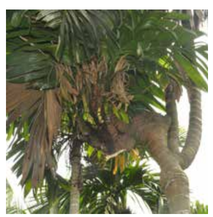
Arecanut palm with four crowns

In the areca garden of Sri C. K. Ummer of the same village, there is a South Kanara Local palm with four crowns. This tree aged about 15 years, until last 3-4 years it was normal with single crown. Later, the palm was infected by bud rot disease, subsequent to infection