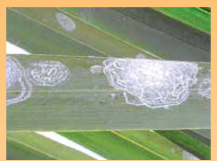
Leaf bit containing E. guadeloupae parasitized RSW pupae used in augmentative biological control