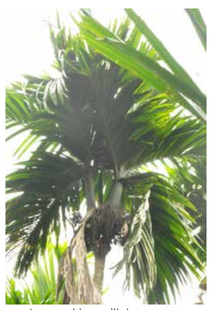
Arecanut tree with two crowns Nagaraja N. R. and Chowdappa P.

and after that two more new crowns formed on the other side of the main crown. From the recently formed crowns, seedlings were formed in the crown itself.