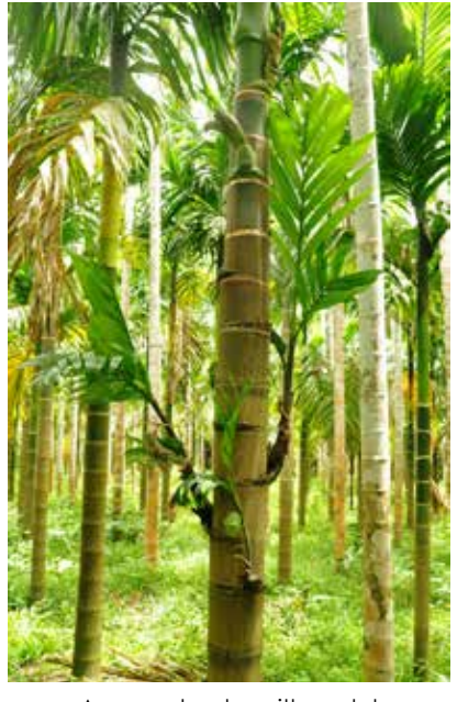
Arecanut palm with nodal inflorescences directly converting into seedlings

two new crowns were formed in one side of the main crown, out of these two crowns normal inflorescence were seen in one crown and the main crown died