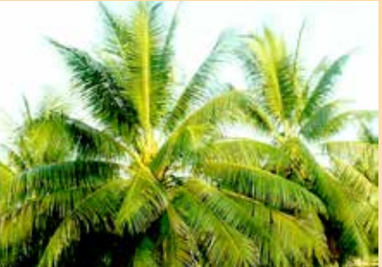
RSW-infestation recovered palm