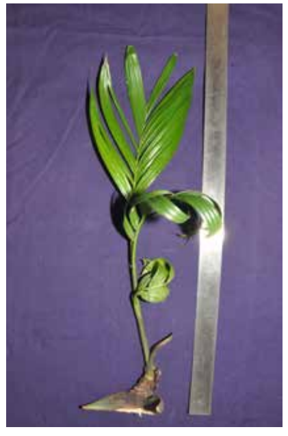
Seedlings collected from the arecanut palm node with inflorescences directly converting into seedlings

and after that two more new crowns formed on the other side of the main crown. From the recently formed crowns, seedlings were formed in the crown itself.