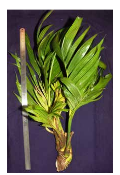
Seedlings collected from the arecanut palm with four crowns

two new crowns were formed in one side of the main crown, out of these two crowns normal inflorescence were seen in one crown and the main crown died