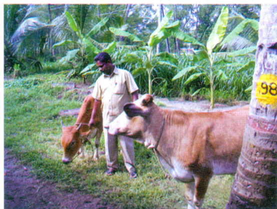
Cow as component of mixed farming