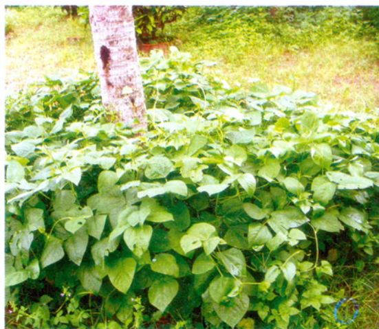
Cowpea as green manure crop

May with receipt of a few showers after applying first split of fertilizers. Uproot and incorporate the plants once they attain maximum vegetative growth (just before start of flowering). Green manure cowpea is easily available and less costly compared to the other types. It can produce around 20-25 kg fresh biomass per coconut basin and on an average can supply N, P and K @ 130, 12 and 115 g, respectively.