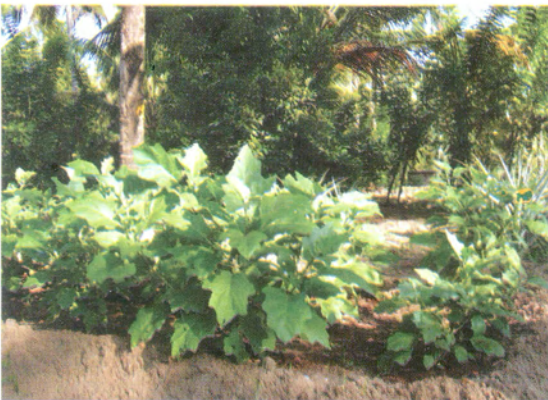
Brinjal as intercrop