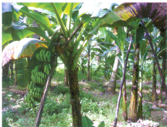
Banana in HDMSCS

small, medium and large canopy architecture and are to be planted in a systematic manner to exploit space both in the vertical and horizontal dimensions. Coconut based HDMSCS can be successfully adopted in root (wilt) disease affected coconut gardens by raising a combination of suitable crops. In such a cropping system, care should be taken to follow the recommended package of practices including adequate manuring for component crops. Vegetables, spices (both annuals and perennials), tuber crops and fruit crops mentioned above can be included under HDMSCS.