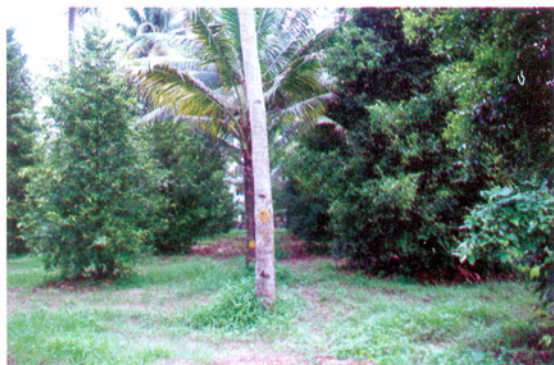
Nutmeg in HDMSCS

Mixed farming system: Fodder crops such as Hybrid Napier, Stylosanthes and fodder cowpea can be raised as intercrops in coconut garden. Co-3 is an ideal fodder grass of Hybrid Bajra Napier, which could be successfully grown in coconut garden. Integrating coconut cultivation with rearing milch animals and raising fodder crops ensures additional income and employment to the farmers. They also provide organic manures for application to coconut and other crops. Installation of biogas plant gives light energy for farm family and slurry for use in the cropping system. Azolla, a floating fern can also be raised in small pits lined with polythene sheets in coconut gardens adopting mixed farming to supplement the feed requirement of dairy animals. Azolla, on dry weight basis, contains 25-35 % protein, 10-15 % minerals and 7-10 % amino acids, and is also rich in vitamins and carotenoids. The rare combination of high nutritive value and rapid biomass production makes Azolla a potential and effective feed substitute for live stocks as it is easily digestible. Azolla can either be mixed with concentrates or given directly to dairy animals.