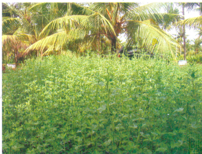
Raising stylosanthes in mixed farming

The entire bio mass recovered from coconut, banana and prunings from glyricidia as well as bio gas slurry, cow urine etc. are recycled into the production system. The results indicate that the mixed farming in root (wilt) disease affected coconut garden is self-sustainable with respect to nutrient requirement of the system.