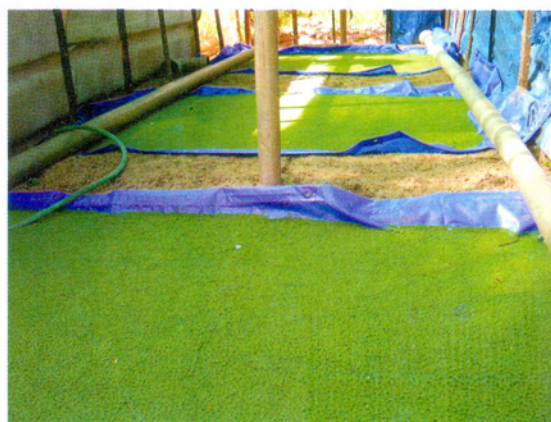
Raising azolla in mixed farming

Greater emphasis is being given on farming system approach as it ensures sustainability both in terms of productivity of crops and long term economic returns. Mixed farming in coconut gardens provides additional income and employment opportunities to the farmers as well as organic manures for recycling in the coconut garden.