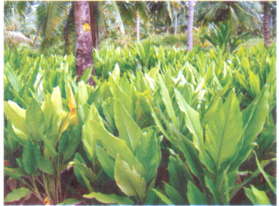
Turmeric as intercrop