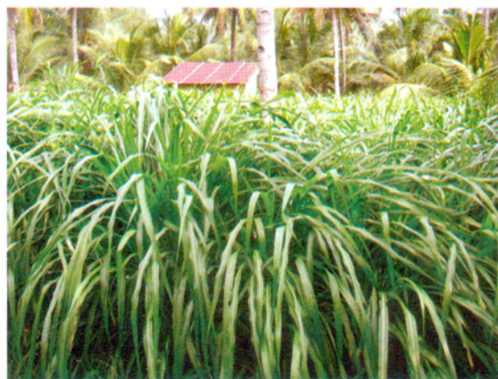
Hybrid Bajra Napier in mixed farming