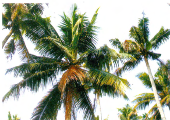
Root (wilt) disease affected coconut palms