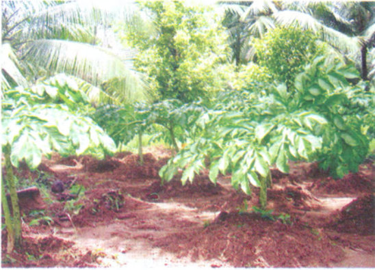
Elephant foot yam as intercrop

esculenta ), Dioscorea (Yams): Greater yam ( Dioscorea alata ) and Lesser yam ( Dioscorea esculenta )