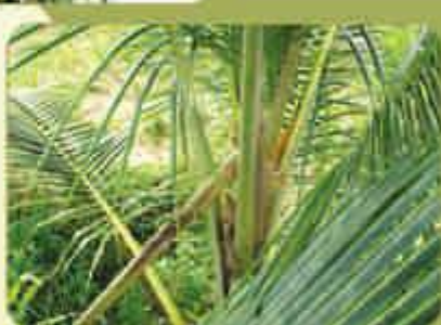
Spindle damage by Rhinoceros beetle