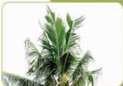
'V' shaped cuts - Symptom of Rhinoceros beetle infestation

Participatory biomanagement of Rhinoceros Beetle