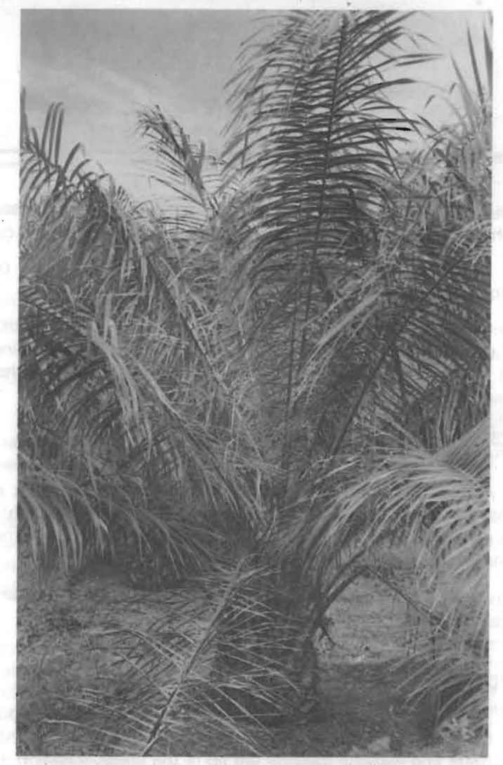
Spear rot affected palm showing leaf yellowing.