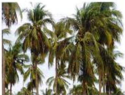
Field view of Kalpa Haritha palms

Work done at ICAR-CPCRI revealed that palms of Chowghat Orange Dwarf (COD) showed minimum level of mite infestation in the field. Malayan Green Dwarf (MGD) and Spicata also recorded comparatively lower level of mite incidence, whereas, West Coast