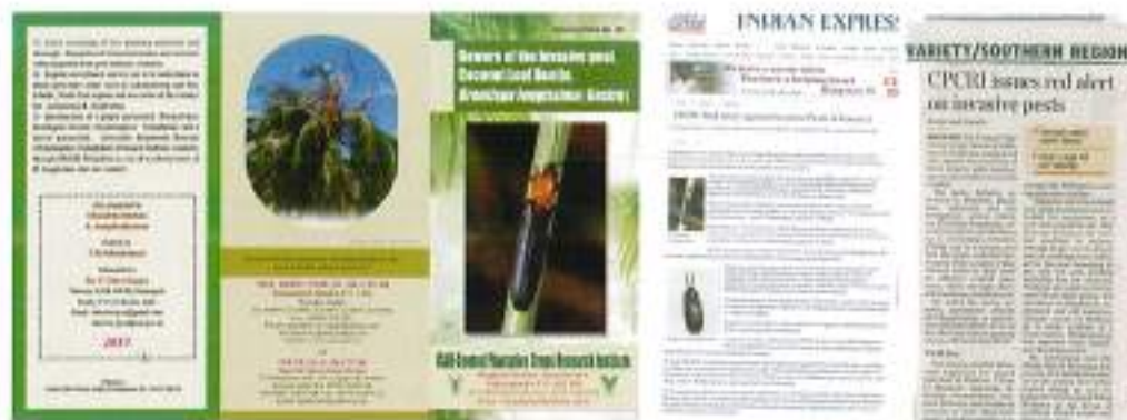
Sensitization bulletins released from ICAR-CPCRI