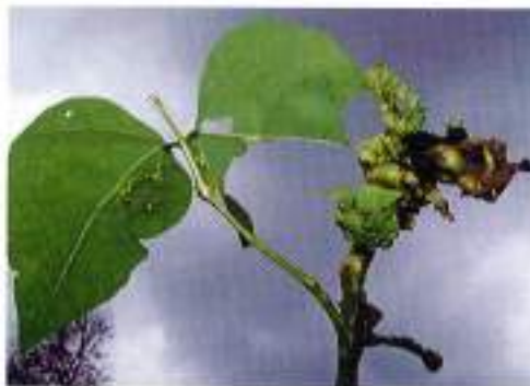
Gall wasp damage on Erythrina sp.

Alien invasive species have invaded native biota in virtually every ecosystem of earth, causing economic damage to biodiversity and the valuable natural agricultural system we depend upon. Such outbreaks of exotic pests viz. , coffee berry borer Hypothenemus hampei Ferrari (Curculionidae: Coleoptera), serpentine leaf miner Liriomyza trifolii (Burgess), (Agromyzidae : Diptera), spiralling whitefly Aleurodicus dispersus Russell (Aleurodidae : Hemiptera), coconut eriophyid mite Aceria guerreronis Keifer (Eriophyidae : Acari), erythrina gall wasp, Quadrasticus erythrinae