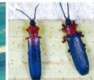
B. longissima and P. reichei