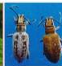
Adult weevils of M. undatus