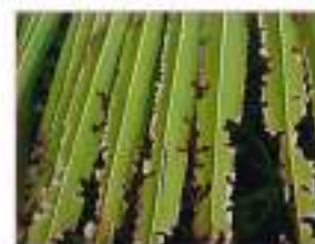
Leaf damage on adult palm and seedlings

India. Eggs are laid on soft organic matter on the ground and the grubs burrow through the soil feeding on the roots of the host plants before pupating in soil. Since the grubs are hidden in the soil, they are difficult to be detected and are thus vulnerable for spread to different regions through transport of coconut seedlings. The pest is likely to have more generations during warm equatorial type of weather conditions prevailing in Kerala triggering to the possibility of an outbreak situation. Currently, this species is known as an invasive pest in Florida occurring on most of the South-Eastern and South-Western coasts and scattered inland regions infesting at least 81 different plant species including three ornamental palm species viz., Burmese fishtail palm, Caryota mitis Lour., Golden cane palm, Dypsis lutescens (H. Wendl.) Beentje & J. Dransf. and Veitchia palm, Veitchia sp.. Very recently M. undatus is reported as a potentially destructive pest of citrus in Florida. Coconut ash weevil, Myloccerus curvicornis Fab. was also noticed on coconut leaves of young palms especially on outer whorls in different tracts of Kerala.