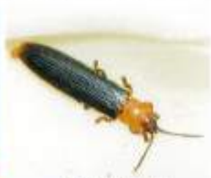
Adult beetle of B. longissima