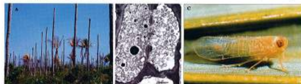
(A) LYD affected coconut palms (B) Electron micrograph of phytoplasma in phloem sieve elements of LYD affected palms (C) Myndus crudus

Lethal bole rot of young palms and seedlings is primarily caused by the fungus, Marasmiellus cocophilus Pegler.