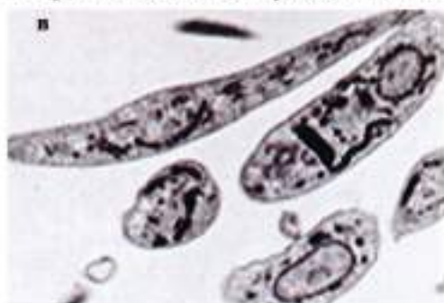
(A) First stage symptoms of hart rot on coconut palm (B) In vitro cultured trypanosomatid isolated from coconut affected by hart rot in transmission electron microscopy

The disease also known as fatal wilt/bronze-leaf wilt or Cedros-wilt or Marchitez is caused by plant trypanosomatids, Phytomonas sp. Yellowing or browning of the oldest leaves, starting from the tips and spreading to the base of the leaf is the prominent initial symptom of the disease. Yellowing progresses to younger leaves while older leaves become necrotic. Inflorescence necrosis and immature nut fall are also observed in affected palms. In the advanced stage of the disease, a rot develops beneath the spear leaf, extending into the apical meristematic region, and the palm dies. Generally, death occurs