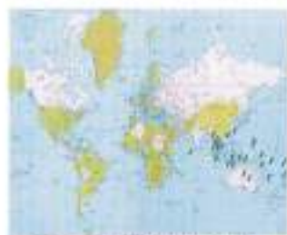
Geo-map of B. longissima incidence

countries like India, Bangladesh and Sri Lanka are ever in red alert zones. For all those countries, where coconut and coconut-based industries support millions of people, the pest incursion would be catastrophic. Coconut leaf beetle (CLB) was originally described in 1885 from Aru Islands in Indonesia and from Papua New Guinea. Over a period of 130 years, it has widely spread in over 25 countries in Asia, Australia and Pacific Ocean Islands attacking a number of cultivated and wild ornamental palm species in addition to coconut palms. It is currently distributed in Australia (Darwin, Broome, Mao Island, Cooktown, Cairns, Innisfail, Marcoola and Townsville), Pacific Ocean Islands, Malaysia, Singapore, Cambodia, Laos, Thailand, Vietnam, Maldives, The Philippines, Myanmar and China. In Solomon Islands, it is estimated that about 5% of CLB infested palms die annually. In 1980, coconut palms grown in more than 10,000 ha area in seven provinces in Indonesia were attacked by this beetle. In Maldives, pest outbreaks occurred on several islands of South