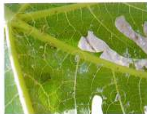
Rejuvenation of papaya after release of exotic parasitoid against mealy bug