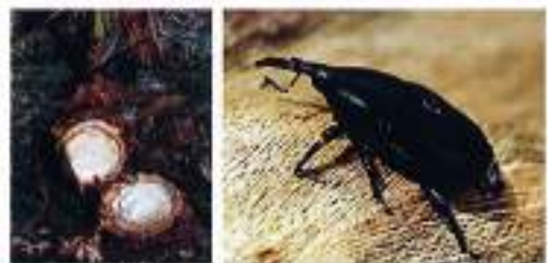
Cross section of trunk of red ring disease affected palm

Juvenile nematodes are transmitted especially during oviposition and other activities. Young palms between 2.5 and 10 years old are susceptible. Yellowing followed by browning and drying of older leaves and premature nut fall are the external symptoms noticed in affected palms. The cross sections of the affected palms show specifically the presence of a reddish-brown ring of 2-4 cm width located 2-5 cm inwards from the stem periphery as the characteristic diagnostic internal symptom of the disease. This extends throughout the