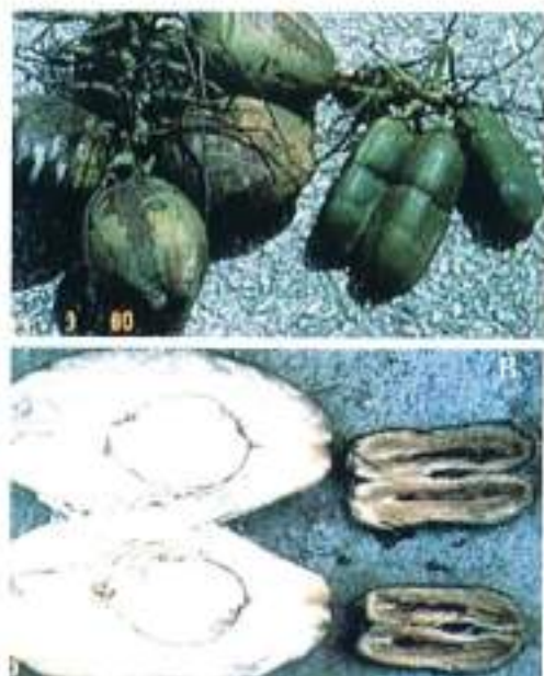
Nut abnormalities associated with tinangaja disease (A) Scarifications and characteristic spindle shape (B) Sections of nuts from healthy and diseased palm showing lack of kernel development

It is distributed in Guam and means of transmission unknown.