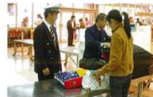
Baggage check for effective quarantine

The Directorate of Plant Protection, Quarantine and Storage (DPPQS) of Ministry of Agriculture and Farmer's Welfare is the nodal agency in India for implementing plant quarantine regulations which have recently been revised and known as the Plant Quarantine (Regulation of Import into India) Order 2003 (henceforth referred to as PQ Order) . DPPQS deals with the commercial import of consignments of grains, plants and plant products for consumption through its network of 35 Plant Quarantine Stations spread across the country including seaports, airports and land frontiers as well as commercial imports of seeds/ plants for sowing or planting through five major stations at Amritsar, Chennai, Kolkata, Mumbai and New Delhi. Besides the twenty-eight plant quarantine stations, there