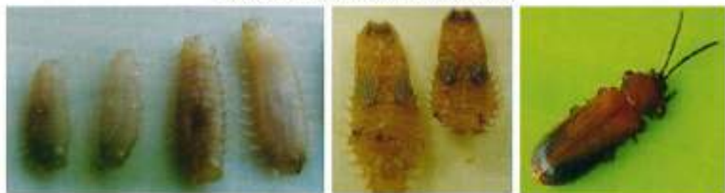
Grubs, pupae and adult beetle of Wallacea sp.