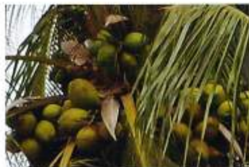
Closer view of Kalpa Haritha

Tall (WCT) and Laccadive Tall (LCT) recorded maximum incidence in the field. WCT with green and oblong nuts recorded higher level of mite incidence as compared to WCT with brown-colored and round-shaped nuts. The overlapping tepal aestivation and tepal tightness which make the entry of mites difficult at the early nut development phase are attributed to the lesser incidence of mite. Of late, a high-yielding, tall genotype recorded with lesser mite infestation at field level was selected at ICAR-CPCRI from Kulasekharam coconut population, christened as Kalpa Haritha and