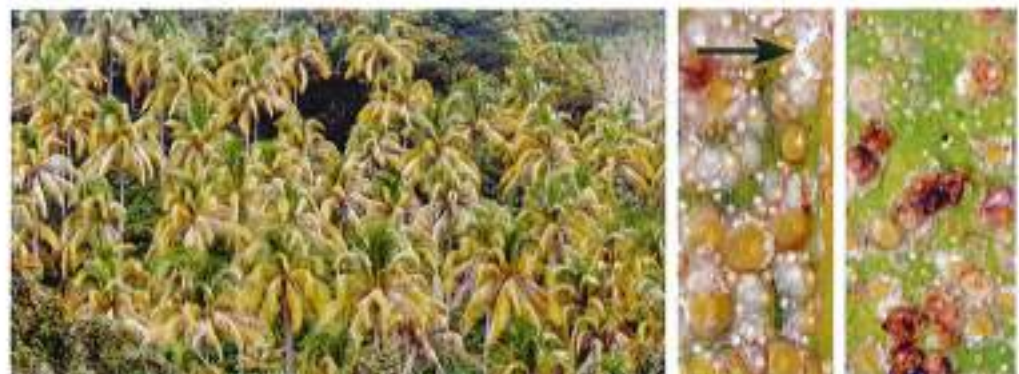
Infestation of coconut by the hard scale Aspidiotus rigidus in The Philippines.

from Kerala, India. Comparison of maximum temperature, relative humidity and rainfall data of June 2011 with that of June 2012 revealed increase in 0.8°C of maximum temperature and reduction in relative humidity and rainfall to the tune of 4.1% and 91.8 mm, respectively. Though A. destructor is under check by natural enemies, A. rigidus is reported to be a ravaging pest in The Philippines incurring huge loss to coconut growers in that country. It is also reported as an emerging invasive threat in our country. The mobile stage being the crawlers and males are easily drifted away by wind or passively carried through any inert packaging materials, nuts, leaflets, dried spathes, etc.