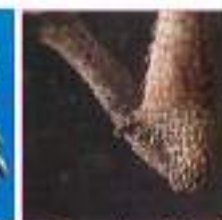
Three-spined hind femur