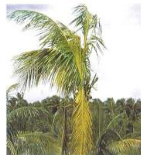
Symptoms of coconut foliar decay disease in Vanuatu

Coconut foliar decay disease is of limited distribution and has been detected only in coconut palms in Vanuatu. Yellowing of fronds in the middle whorls (about 7 to 11 positions down from the unopened spear leaf) is the initial symptom of the disease. Fronds that dry prematurely, hang down through the normal lower whorls of the crown. This is followed by yellowing and drying of other fronds in the crown. Susceptible cultivars like Malayan Red Dwarf die within 1 to 2 years after the appearance of the first symptoms. The disease is caused by an icosahedral coconut foliar decay nanovirus (CFDV) and is transmitted by the planthopper, Myndus taffini Bonfils