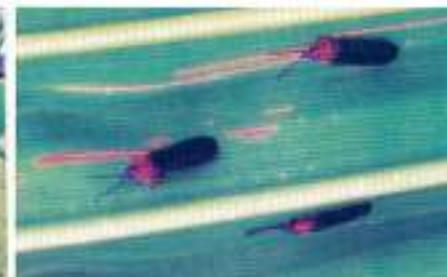
Feeding damage by P. reichei