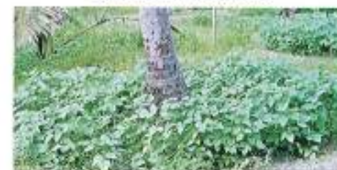
Cow pea in palm basin for biomass recycling