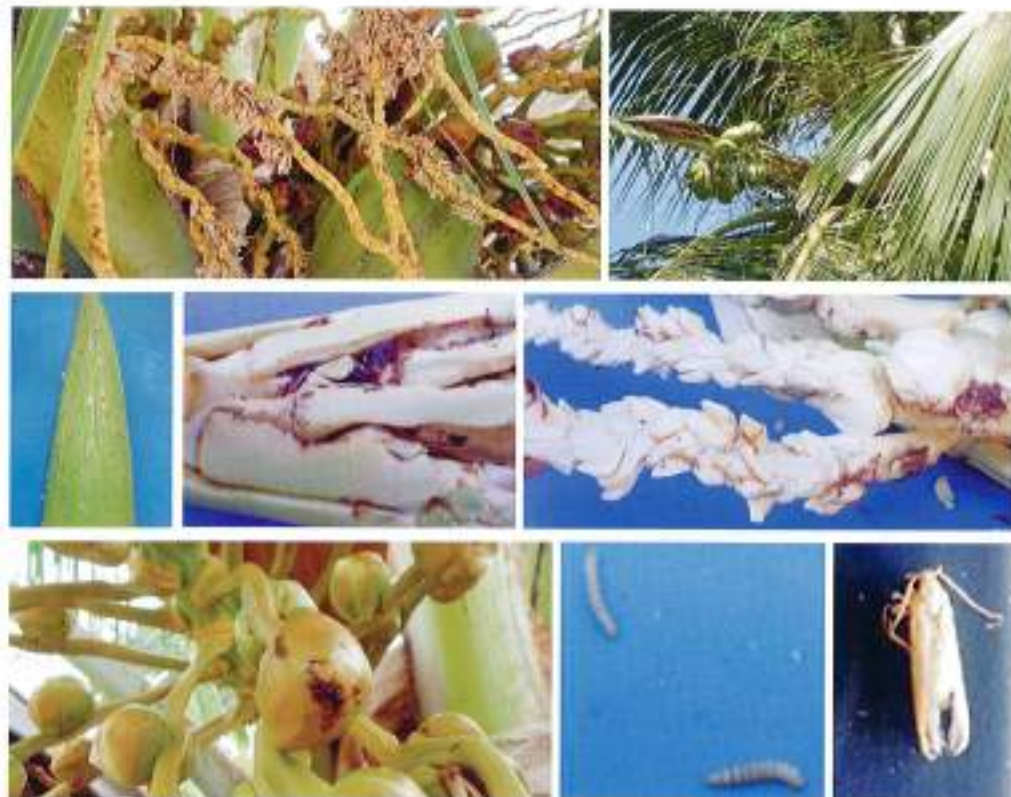
Damage symptoms and biology of B. arenosella

all palms are seen infested at Raipur, Chhattisgarh. Gummy exudates on unopened spathes are amply visible and male flowers turn necrotic. Rarely infestation is also observed on buttons. The infested inflorescences exhibit the clinging of dried male flower parts over the spikelets making a dry appearance. Caterpillars are found to feed on the pollen grains of the male flowers. It is all likely that the pest could induce out-crossing in affected dwarf palms enhancing heterozygosity among the progenies. B. arenosella was reported as third important insect pest of coconut in