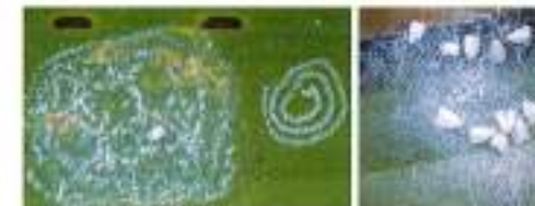
Damage symptoms of spiralling whitefly

parasitized by the aphelinid parasitoids. Adults measure about 2 mm length with white wings. Direct feeding even under heavy infestations is usually insufficient to kill palms and no significant yield loss is being reported. Indirect damage is mainly accomplished by the accumulation of honeydew and white, waxy flocculent material produced by the adult whiteflies. In addition to the accidentally introduced aphelinids, viz., Encarsia guadeloupae Viggiani and Encarsia sp. nr. haitiensis Dozier, several natural enemies have expanded their host range to this invasive pest in India. At least two different species of lady beetles viz., Chilocorus subindicus Booth ( Coccinellidae : Coleoptera ) and Scymnomorphus sp. ( Coccinellidae : Coleoptera ) were found predatory on spiralling whitefly as well as on coconut scale insects. Furthermore, a nitidulid predator Cybocephalus sp. ( Nitidulidae : Coleoptera ) identified by its hump-backed appearance is associated with bio-suppression of the