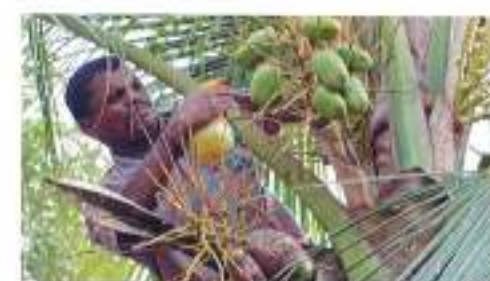
Spraying with botanicals