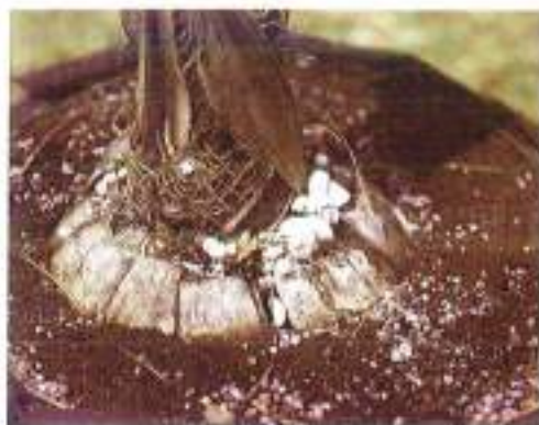
Sporophores of Marasmiellus cocophilus on a coconut seedling. (Photo reproduced from FAO/IBPGR technical guidelines for the safe movement of coconut germplasm)

Leaves wilt, become yellow and bronze. The spear leaf dies and a foul-smelling soft rot develops at the base of the leaves and spathes. On mature palms, leaves remain attached as a 'skirt' around the trunk. A reddish dry rot of bole along with decay of roots were observed in affected palms. M. cocophilus causes death in palms up to 8 years old. Spread occurs through soil, root contact between palms, infected coconut debris and probably by air-