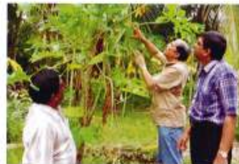
Regular surveillance in strategic zones

Regular surveillance surveys should be carried by all ICAR institutes, SAU and other stakeholders such as Coconut Development Board (CDB) at all strategic points of entry. More closely North-East regions, Lakshadweep and Bay Islands should be under strict surveillance by constant observation on buffer crops in those regions along the airport and seaport zones. With increasing navigation network these days, such surveillance surveys on regular mode is found mandatory. A national level incursion management team comprising of experts from all disciplines as well as an emergency preparedness module would be the need of the hour to tackle accidental introduction of invasive pests including gradient as well as epidemic outbreaks of emerging pests into the country. Concerted efforts for conservation of different natural enemies in the ecosystem are warranted for preventing emerging pests attaining epidemic levels.