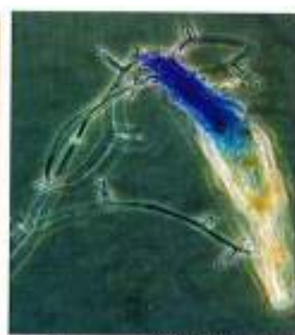
H. thompsonii infected mite