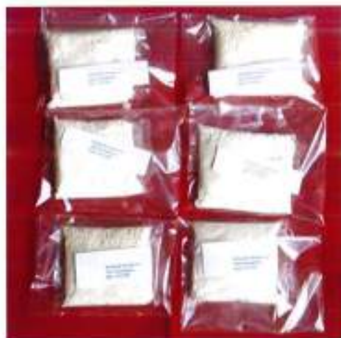
Talc-based preparation of H. thompsonii

and adoption of soil conservation measures were also recommended for the management of the pest. Three sprayings of palm oil (200 ml) and sulphur (5 g) emulsion along with 10 g soap powder in 800 ml of water on the terminal five pollinated coconut bunches during January-February, April-May and October-November evinced significant reduction (67.4 to 69.8%) of mite incidence. Application of talc-based preparation of H. thompsonii @20 g/litre of water / palm containing 1.6 \times 10^6 cfu with a frequency of three sprayings per year resulted in 63-81% reduction in mite incidence.