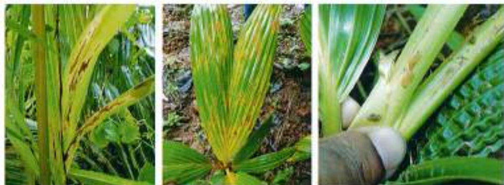
Damage symptoms on coconut seedlings

90% of seedlings were infested by the pest damaging about 40% of leaf area, there was no seedling mortality. Invasive nature of Wallacea sp. is under scrutiny, as another chrysomelid beetle, Wallaceana sp. was reported from Indonesia. Adult beetles are brownish with six rows of constrictions on each elytron and measured 4.72 mm long and 0.9 mm wide. They are active fliers and may be for a short distance. Grubs possessed short-lateral spines on each body segments with prominent mandibles for active feeding and measured 5.75 mm long and 0.8 mm wide. Grubs and adults remain within the folds of the spindle leaves and feed from within. Typical feeding damage