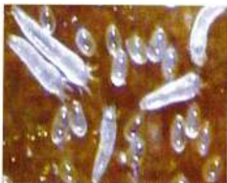
Microscopic view of coconut eriophyid mite

a) Coconut eriophyid mite: The exotic pest, coconut eriophyid mite, Aceria guerreronis Keifer was reported from all coconut growing regions ranging from 0.2% in Bay Islands to 57.3% in Karnataka. Ever since the pest was first reported in the country from Kochi, Kerala during 1998, it had spread like a wild fire affecting all coconut plantations in key south Indian states. Notwithstanding the higher mite incidence during the initial years of emergence (1999-2002), the percentage incidence of mite diminished in subsequent years (2010-2012) with the population buildup of natural enemies especially the predatory mite ( Neoseiulus baraki ) as well as the acaropathogen, Hirsutella thompsonii Fisher in the system.