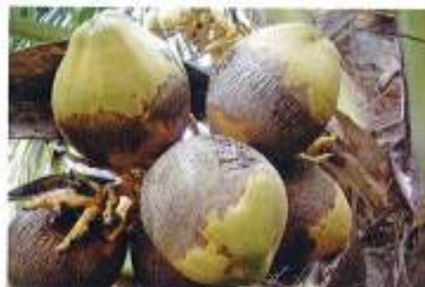
Mite damage symptoms on nuts