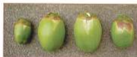
Progression of mite infestation

The integrated pest management (IPM) strategy for suppression of A. guerreronis consists of phytosanitary measures in coconut plantations including crown cleaning, burning of fallen mite-infested nuts and plant protection operation by spraying/root feeding of botanical pesticides (azadirachtin-based) thrice a year. In addition to this IPM package, adoption of integrated nutrient management package including application of NPK fertilizer as per recommended levels, recycling of biomass or raising and incorporation of green manure crops in coconut basins, summer irrigation