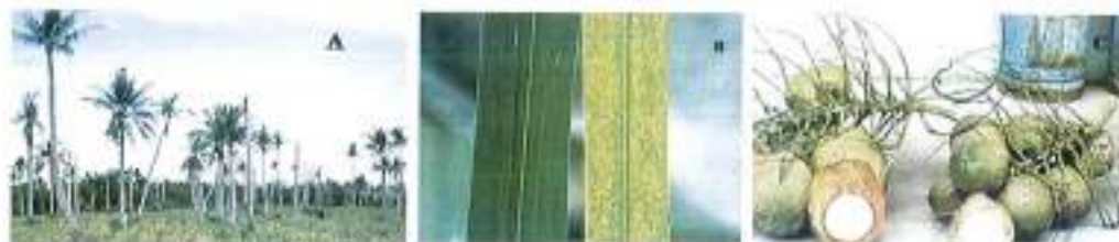
Symptoms of cadang-cadang disease: A- An area of high incidence of cadang-cadang disease in the Philippines B- Leaflets from healthy palm (left) and a palm with late stage disease showing non-necrotic chlorotic spotting (right). C- Nuts from healthy palm (left) and diseased palm showing rounding, equatorial scarifications and reduced husks (right).

eight to 16 years after the appearance of the initial symptoms. Variants of CCCVd occur in other members of the Arecaceae including oil palm ( Elaeis guineensis Jacquin) and buri palm ( Corypha elata Roxburgh.) and viroid-like sequences related to CCCVd have also been identified in a range of tropical monocotyledons in South-East Asia and Oceania. CCCVd has not been reported from India till date. In the field, natural transmission is observed but the mechanism remains as yet unknown. Pollen transmission is suspected.