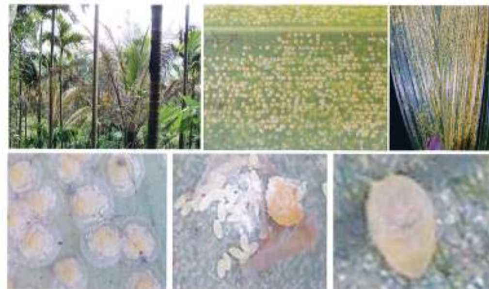
Damage symptoms and biology of hard scale Aspidiotus destructor

minor pest reported from Kerala, Tamil Nadu and other coconut growing tracts of the country. Gradient outbreak of coconut scale insect, A. destructor was observed at Chingoli near Kayamkulam, Kerala during August-September 2012. Though the pest attack was confined in a limited pocket on coconut leaflets along a homestead farm pond, rise in maximum temperature and reduction in relative humidity and rainfall during June-July 2012 could be the major reasons for the immediate flare up of the pest which was otherwise not reported as a major pest of the region. Population build up of the pest was so high that caused severe yellowing as well as drying of coconut leaflets in the region. This could be one of the earlier reports on temperature induced pest outbreak