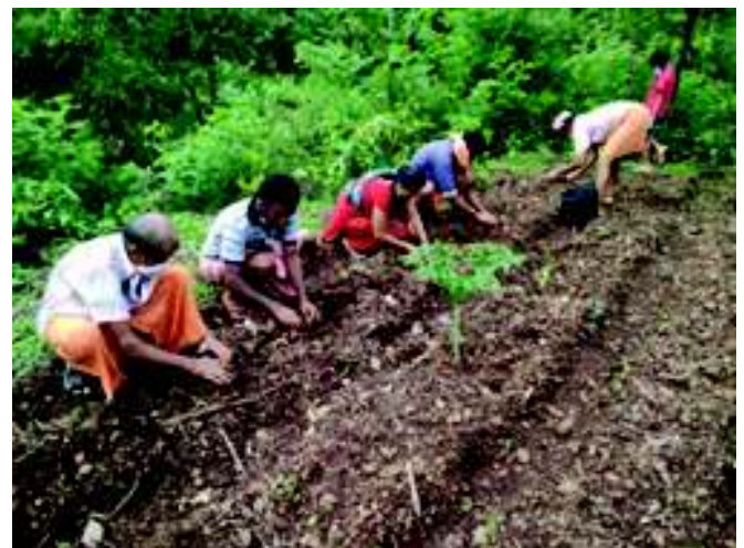
Planting of turmeric rhizome