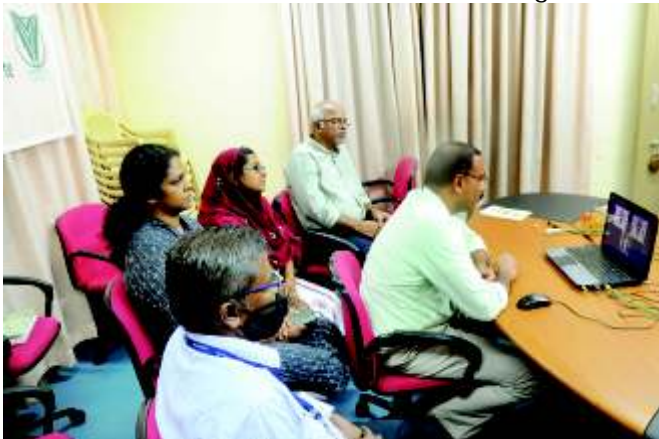
Experts from ICAR-CPCRI, Kasaragod participating in Haritha Kerala Mission Facebook Live interaction