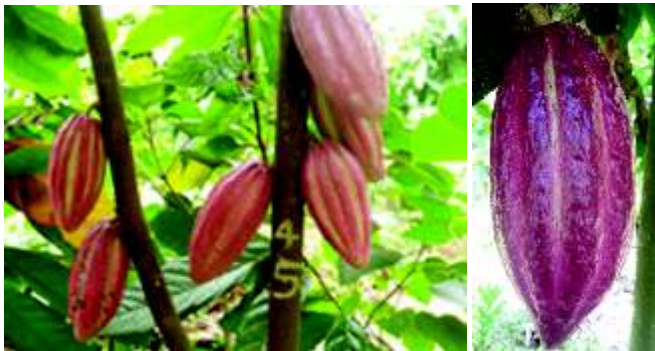
Fig. 3. Cocoa pods of Trinitario selection (Big pods 1000 g)