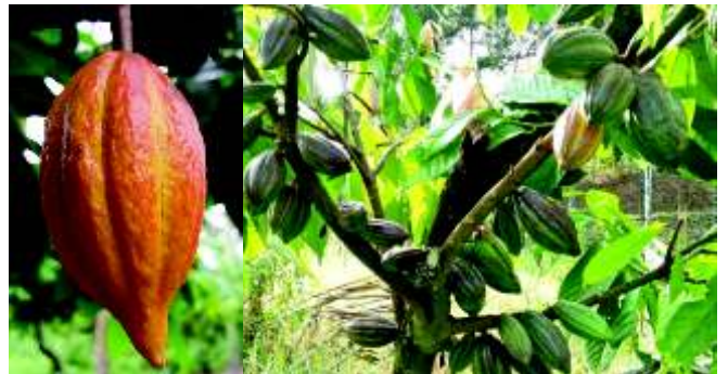
Fig. 4. Cocoa pods of Amelonado selection (Small pods 100 g)