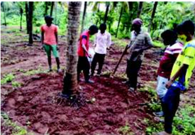
Sowing of cowpea seeds in coconut basin

Farmers Helpline. KVK Kasaragod has been identified as Farmers helpline centre for Kasaragod district to address various queries related to crop production, protection and post-harvest technologies of different crops grown in the district during the lockdown period. In this connection, attended 528 queries during this period.