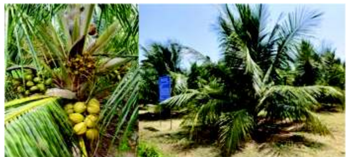
Fig. 5. Fertigation experiment with hybrid coconut Kalpa Sankara

A field experiment is in progress at ICAR-CPCRI, Regional Station, Kayamkulam since 2017 with five treatments: T1-50%, T2-100%, T3-150%, T4-200% of soil test based nutrient recommendation through fertigation and T5 with basin application of nutrients under drip irrigation, in 'Kalpa Sankara' variety of coconut. Fertigation was scheduled with conventional fertilizers, urea and muriate of potash (for N and K) in the proportionate doses required. Phosphorus was applied as basal dose in the form of Rajphos. Organic manure at the rate of 25 kg/ palm was applied in the basins every year. Water and nutrients were applied in different treatments in 20 split applications per year. Results obtained during the third year after planting revealed precocious flowering and more number of inflorescences in all palms under fertigation treatments, compared to T5 (Fig. 5. surface application