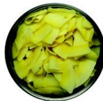
Fig. 9. Coconut chips with jaggery infusion

acceptability by the panellists. Mineral analysis of the sample reveals that the developed product is rich in both micro and macro mineral content than refined sugar-based chips (iron-5.141 mg, zinc- 3.51 mg, manganese- 3.85 mg, sodium- 418.67 mg, potassium -291 mg per 100 g of chips sample).