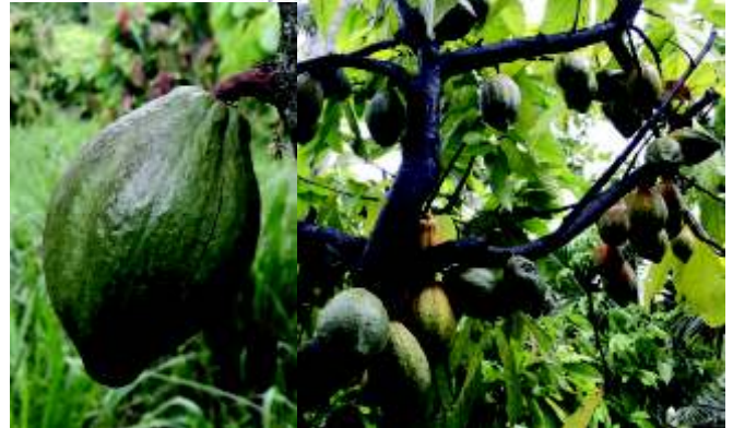
Fig. 2. Cocoa pods of VTLC 2 (Short pods 10 cm)