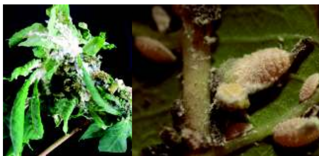
Fig. 6. Cassava affected with mealybugs (Inset: mealy bugs)

emergence of fresh shoots. Strict domestic quarantine is to be imposed to prevent the indiscriminate movement of planting material (setts) and to curb the spread of the pest into other tapioca-growing areas.