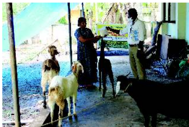
Mineral mixture for goat