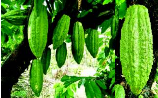
Fig. 1. Cocoa pods of VTLC 8 (Long pods >20 cm)

have distinct morphological characteristics and pod features which have been found to be stable over locations (Fig. 1 to 4).