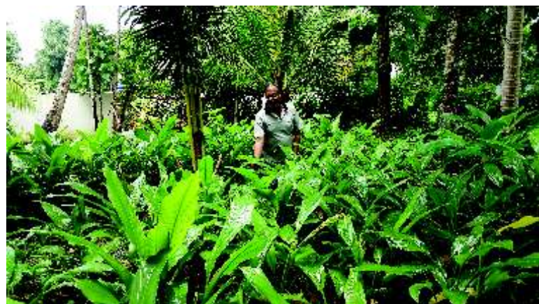
FLD on turmeric cultivation