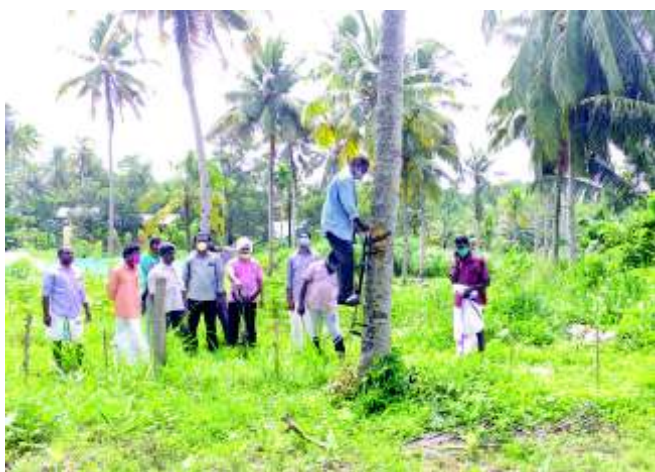
Participants getting trained to climb coconut palm with the climbing device

A twenty-five days skill training programme on 'Friends of Coconut Tree (FoCT)' sponsored by Agricultural Skill Council of India (ASCI) and attended by 20 selected rural youth was conducted from 5th February to June 25th, 2020 at KVK - Alappuzha. The trainees were trained to climb coconut tree using a climbing machine. They were also given training on scientific coconut cultivation, pest and disease management, seedling production, management of coconut nurseries, banking, entrepreneurship development etc.