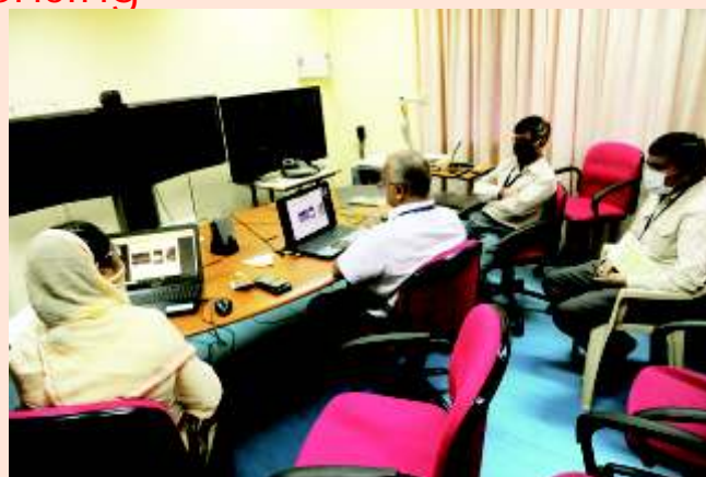
Experts from ICAR-CPCRI, Kasaragod, interacting with entrepreneurs

Kalpa Green Chat was organized jointly by the Kalpa Agri-Business Incubator, ICAR-CPCRI and Kerala Startup Mission, aiming at promoting entrepreneurship with technology base in agriculture sector. In the backdrop of COVID-19 pandemic, the Kalpa Green Chat series were conducted on every Saturday to benefit a wider range of participants. Multilingual interactions were held, facilitated by a panel of scientists. During June 2020, the following six programmes were conducted.