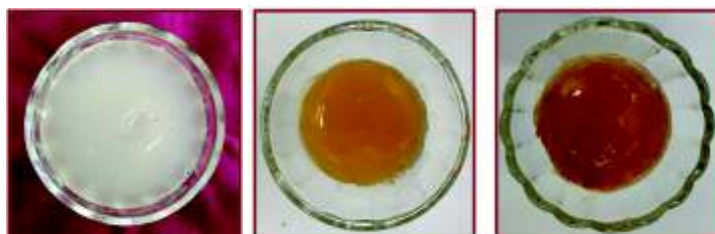
Fig. 7. Coconut water-based jelly

equivalents. The colourants were applied as additives to the jelly prepared from the coconut mature water (Fig 7 & 8). The physicochemical properties of the resultant food products and their organoleptic characteristic features are being investigated. This research output is a prelude towards finding an appropriate end-use for the nutrient-rich coconut-based products.