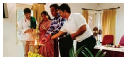
Inauguration of function

was organized at ICAR-CPCRI, Regional Station, Vittal on 23 rd December 2022 in connection with the Farmers' Day celebrations.