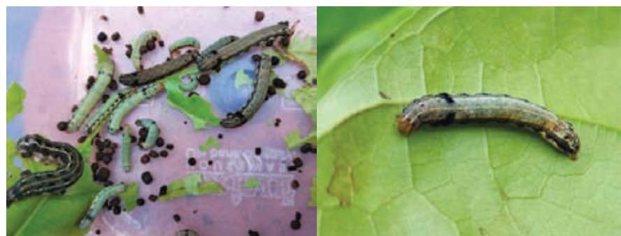
Different stages of caterpillars collected from cocoa nursery

During September to October 2022, sudden insect pest attack was noticed with feeding marks, punctures, scrapping of leaves and defoliation in 2 to 4 months old cocoa seedling nursery of ICAR-CPCRI, Regional Station, Vittal. The symptoms were typical with scraping of lower surface, leaving upper epidermis, causing windowing, eating away of soft leaves, leaving midribs, causing skeletonization, with extensive defoliation. Morphological inspection of larvae of different instars confirmed as first