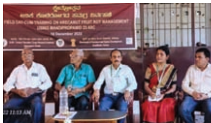
A view of the Field Day programme at Alangar, Udupi district

A farmers training programme on 'Recent advances in arecanut health management and entomopathogenic nematode (EPN) technologies was held at Puthige village in Kasaragod district and Palthady village in Puttur Taluk on 27 th October 2022 and 9 th November 2022 with the financial support of Directorate of Arecanut and spices development (DASD), Calicut. A total of 114 farmers participated.