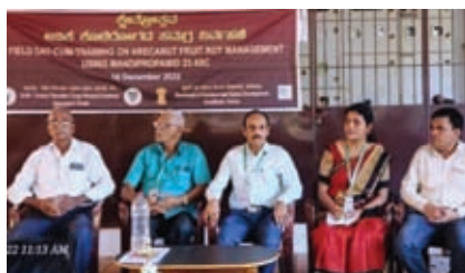
A view of the Field Day programme at Alangar, Udupi district

A farmers training programme on 'Recent advances in arecanut health management and entomopathogenic nematode (EPN) technologies was held at Puthige village in Kasaragod district and Palthady village in Puttur Taluk on 27 th October 2022 and 9 th November 2022 with the financial support of Directorate of Arecanut and spices development (DASD), Calicut. A total of 114 farmers participated.