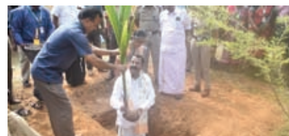
Shri. Sreedharan Pillai, Hon'ble Governor, planting coconut seedling