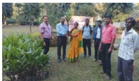
Planting material distribution