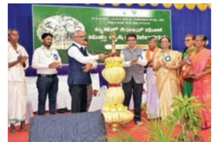
Inauguration of Kisan Mela

Other events organized in the Mega Kisan Mela include (i) Bio-diversity conservation fair; (ii) Demonstration of drone technology; (iii) Farmer scientist interface programme; (iv) Sustainable arecanut farming