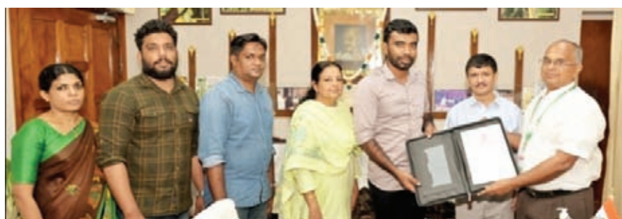
Exchange of MoA on aerated tender coconut water technology to an entrepreneur from Malappuram