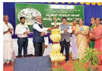
Inauguration of Kisan Mela

Other events organized in the Mega Kisan Mela include (i) Bio-diversity conservation fair; (ii) Demonstration of drone technology; (iii) Farmer scientist interface programme; (iv) Sustainable arecanut farming