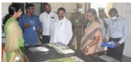
Shri. Sreedharan Pillai, Hon'ble Governor at ICAR-CPCRI, RS, Kayamkulam

Shri. Sreedharan Pillai, Hon'ble Governor of Goa visited ICAR-CPCRI, Regional Station, Kayamkulam on 28 th November 2022. He planted a Kalpa Vajra coconut seedling at Kayamkulam during the occasion.