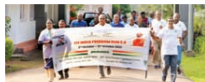
Fit-India freedom run 3.0 at Kasaragod

Run 3.0 - Azadi ka Amrut Mahotsav was organized at ICAR-CPCRI, Kasaragod