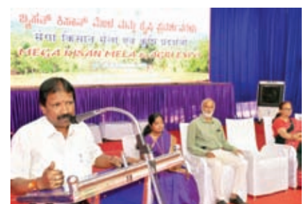
Sri. Angara, Hon'ble Minister, addressing the gathering.