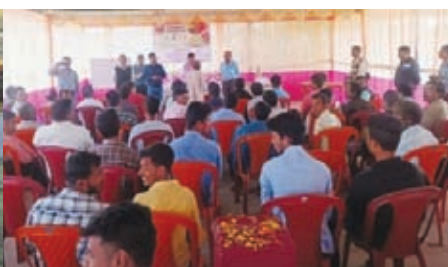
Inauguration of function