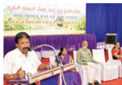
Sri. Angara, Hon'ble Minister, addressing the gathering.