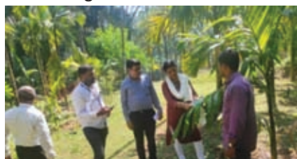
View of leaf spot affected gardens in Udupi district