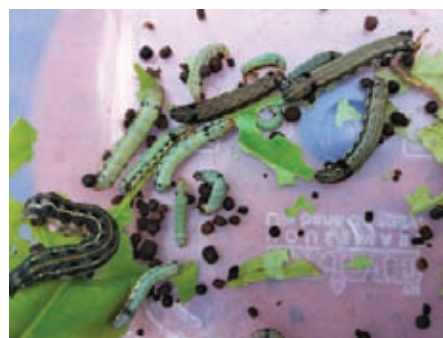
Different stages of caterpillars collected from cocoa nursery

During September to October 2022, sudden insect pest attack was noticed with feeding marks, punctures, scrapping of leaves and defoliation in 2 to 4 months old cocoa seedling nursery of ICAR-CPCRI, Regional Station, Vittal. The symptoms were typical with scraping of lower surface, leaving upper epidermis, causing windowing, eating away of soft leaves, leaving midribs, causing skeletonization, with extensive defoliation. Morphological inspection of larvae of different instars confirmed as first