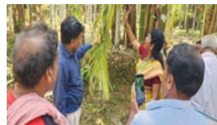
Field diagnostic visit of pest and diseases at Puthige village