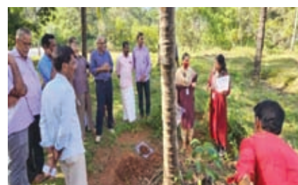
Field demonstration of soil sample collection

ICAR-KVK, Kasaragod organized a programme at Mundithadka in Badiadka Grama Panchayat.