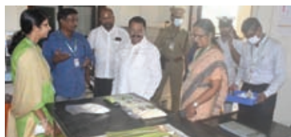
Shri. Sreedharan Pillai, Hon'ble Governor at ICAR-CPCRI, RS, Kayamkulam

Shri. Sreedharan Pillai, Hon'ble Governor of Goa visited ICAR-CPCRI, Regional Station, Kayamkulam on 28 th November 2022. He planted a Kalpa Vajra coconut seedling at Kayamkulam during the occasion.