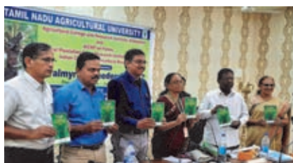
Dignitaries releasing publication during the meet at Killikulam

the meeting which was organized by Kalpa Agri Business Incubator.