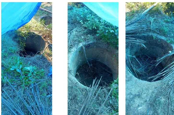
Weed composting in concrete rings