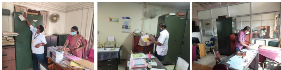
Cleaning work premises