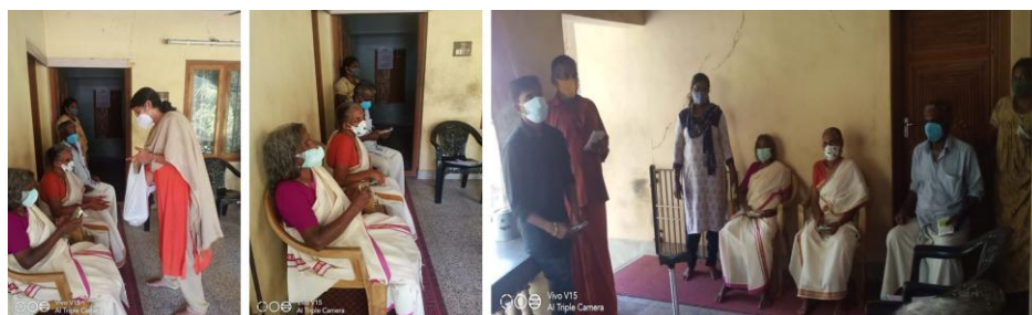
Distribution of vegetable seeds to women farmers