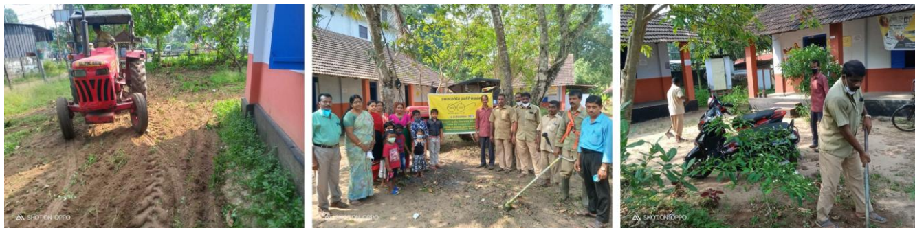
Cleaning the premises of Rama Varma Vilasam LP School, Mukkada Krishnapuram