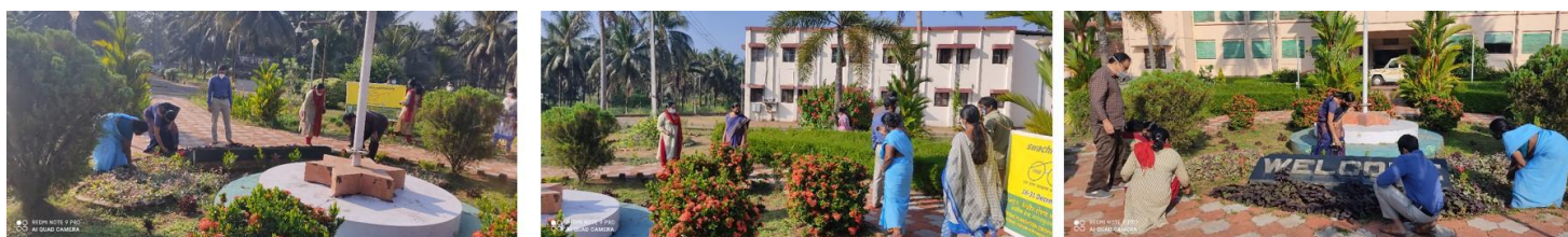
Cleaning of campus garden