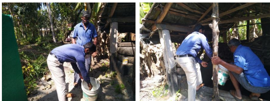
Distribution of metarhizium to the neighboring farmers