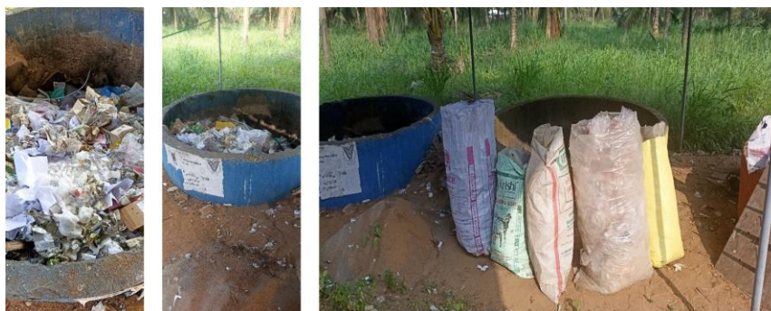
Segregation of plastic wastes