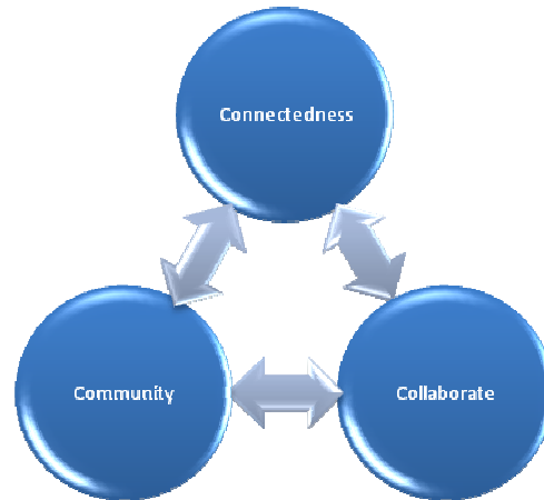
Figure 1: Characteristics of Social Media

Pictorially, the characteristics have been depicted below to show the inter-linkages between all characteristics and their mutual dependency.